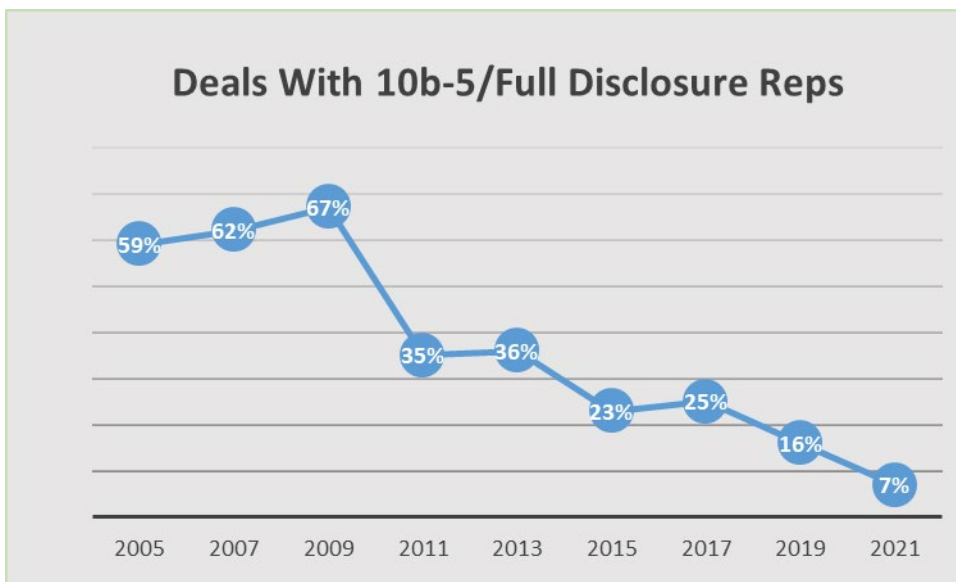
GRAPHIC—Source: ABA Private Target Mergers and Acquisitions Deal Points Studies